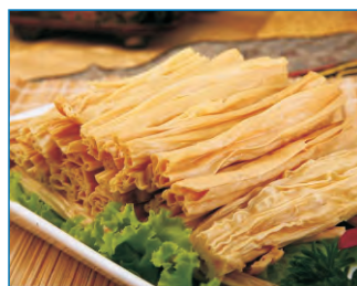
Bean curd stick drying