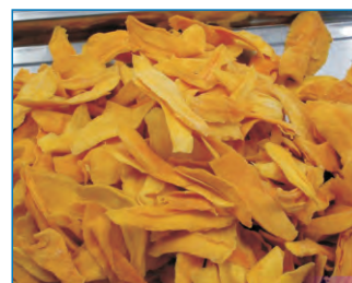
Sweet potato drying