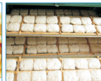
Bean vermicelli drying