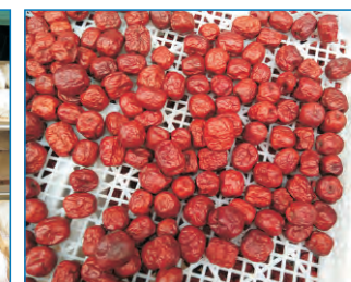
Red date drying